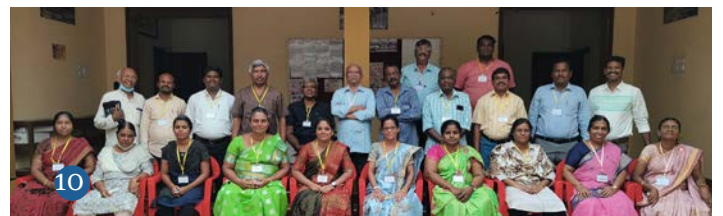
1. Inner Healing Session| 22nd October 2022