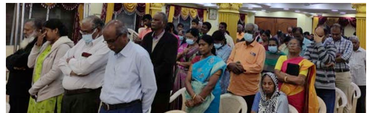
Retired missionaries @ Christmas get to gather